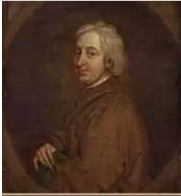
John Dryden The Longer Poems - Volume 2 "Errors like straws upon the surface flow. Who would search for pearls must dive below."